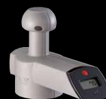
TLC – Towbar Load Control