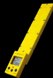
CWC – Caravan Weight Control

REICH UK Office Tel No 01543 459243 Fax No 01543 275929 infoUK@reich-web.com www.reich-web.com